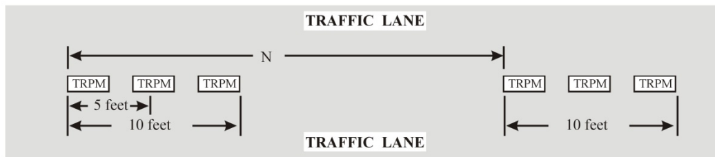
SIMULATING A BROKEN LINE

N = the length of one line segment plus one gap