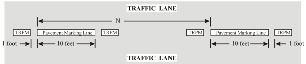
SUPPLEMENTING A BROKEN LINE