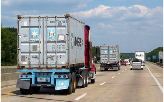
Highway congestion impacts regional freight mobility

Recommendation 6a: Develop and implement a framework for regional truck data collection and use. Through this effort, MnDOT and the Metro Council should identify key highway freight corridors to better understand the relationships between peak-period truck traffic and peak highway congestion, as well as relationships between regional truck trip patterns and travel time reliability of the highway system. This analysis will identify existing and future