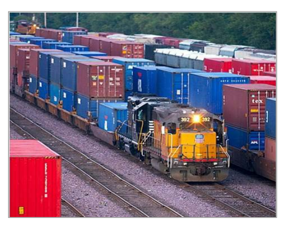
Truck/rail intermodal freight facility

In many cases, local roadways provide the "lastmile" connection between intermodal terminals and the metropolitan highway system, which is part of the National Highway System (NHS). The condition and capacity of connector roadways affect efficient access to multimodal options at intermodal freight terminals. The Federal Highway Administration allows these roads to be designated as "intermodal connectors," making them eligible for the same funding from the National Highway Performance Program that is used to improve the NHS. Few regional roadways are currently designated as NHS connectors and it is likely additional routes could meet the criteria for this designation.