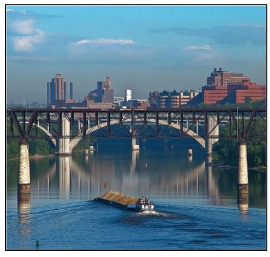
River barge on the Mississippi River

years and there are active barge terminals in Saint Paul, Savage, and Minneapolis. Redevelopment pressures for office and residential units and/or the desire to develop the waterfront as an amenity, have led to the planned closing of Port of Minneapolis terminals and could lead to further terminal closures in the metro area. While there has been a certain level of phasing out of some river-dependent industries in the metro area, land for such active and established, water-dependent industries should be maintained to preserve the region's economic health and local, family-wage jobs. With respect to local industry access to the region's rail system, commodity shipments by rail have been growing and demand for direct rail access is likely to increase in the near future. As a result, the growing challenges to trucking