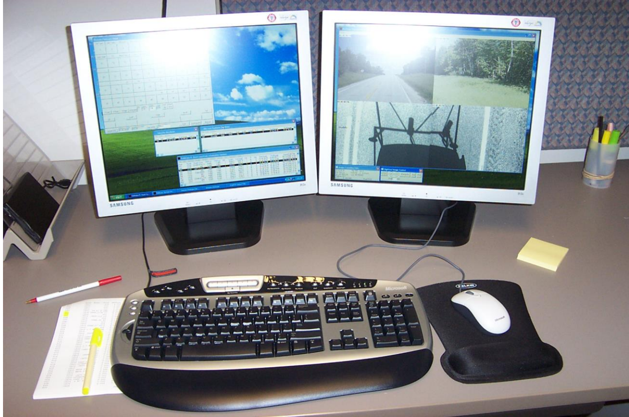
Figure 6. Digital Image Workstation

The workstations allow the operators to view and analyze the digital images captured by the van. The van captures four images that are shown on four monitors simultaneously. There is a front, side and two down views which help the operator determine the type and severity of each defect. On divided roads, each direction is treated as a separate road and rated separately. This is necessary because the type, age and rehabilitation history may vary from one side of a divided road to another causing a difference in pavement performance. The software assists in the calculation of the quantity of distress.