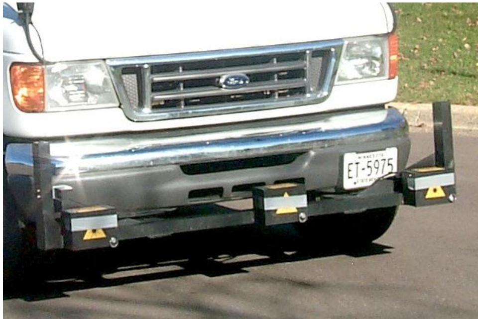
Figure 2. Close-up of lasers used to measure roughness & faulting.

compare the performance of different roadways, pavement designs and for project planning and programming.