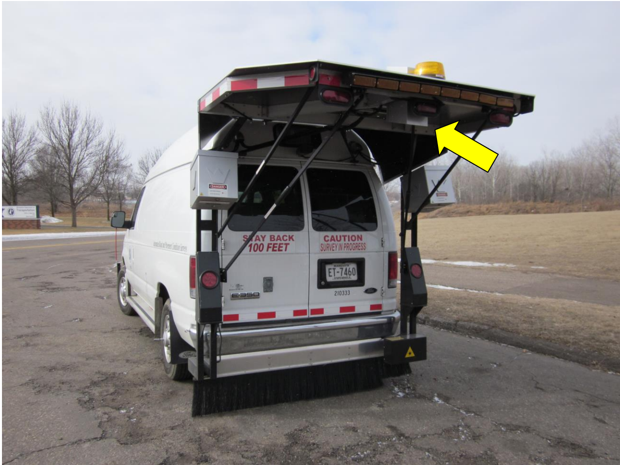
Figure 4. Close-up of 3D camera used to record pavement distress.