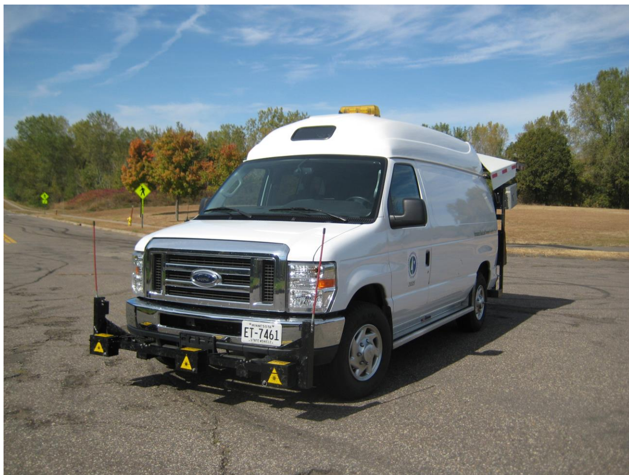
Figure 1. Mn/DOT's Pathway Services, Inc. Digital Inspection Vehicle (DIV)

Mn/DOT currently collects pavement condition data using a Pathway Services, Inc. Digital Inspection Vehicle (DIV) as shown in Figure 1. There are three lasers mounted across the front bumper, one in each wheel path and one in the center (Figure 2). In addition, there are two lasers used for rut measurements (Figure 3) and for collecting 3-dimensional images of the pavement surface (Figure 4) mounted on the rear of the vehicle. The front lasers measure the pavement's longitudinal profile, used to calculate roughness. They take a measurement approximately every 1/8-inch as the van travels down the roadway at highway speed. The cameras are used to capture the pavement distress (cracking, patching, etc.), right-of-way images, and help assess the overall condition of the shoulders.