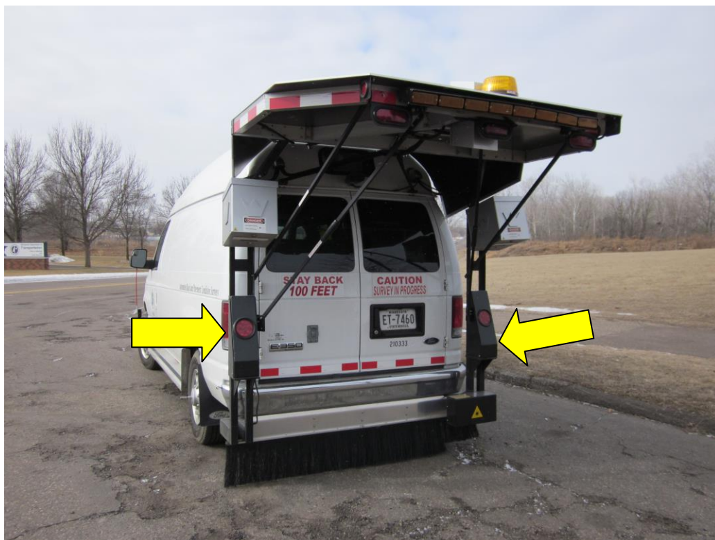
Figure 3. Close-up of 3D-Rut Measurement Lasers.