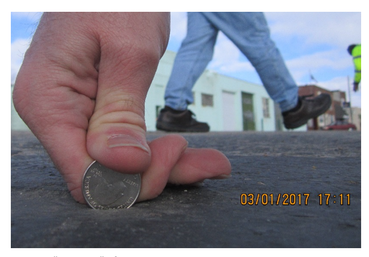
Figure 2 "Coin test" of mastic repair.