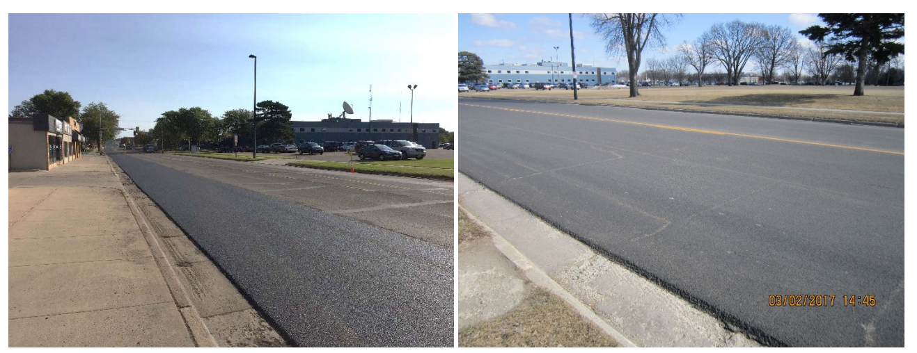
Figure 5 Minnesota Trunk Highway 15: (Left) during 2016 UTBWC mill and overaly, (Right) spring 2017.

the milled surface. It was observed that reflective cracking had occurred during the first winter, and that the aggregates around the cracks appeared to be exposed to damage by snow plowing; indicating possible localized heaving, or tenting of cracks. Ride was satisfactory.