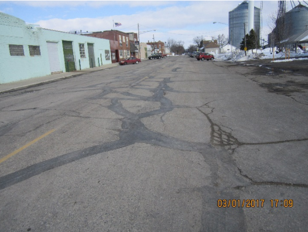
Figure 1 (Left) County Road 3 in 2014, prior to mastic. (Right) In 2017, after mastic.