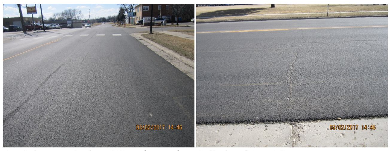
Figure 6 Minnesota Trunk Highway 19, 2017 perfromance of UTBWC mill and overaly in Marshall, MN