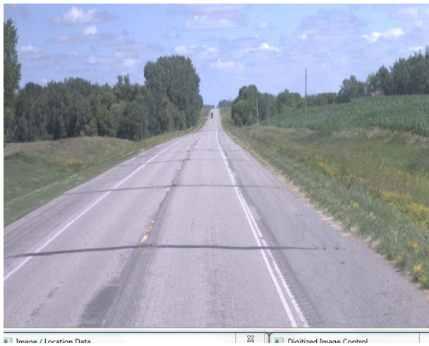
Figure 4 Mastic treatment on MN TH15.

Multiple formulations of mastic material was tried on Bituminous: transverse cracked full-depth asphalt, and Concrete ramps: sound joints with panel breaks. District forces installed material between 2016 – 2017. The installation involved trying various aggregate sizes, formulations of the hot melt component, and kettle temperatures. Material that had been overheated was still able to perform, but had a sunken appearance. Ride was satisfactory.