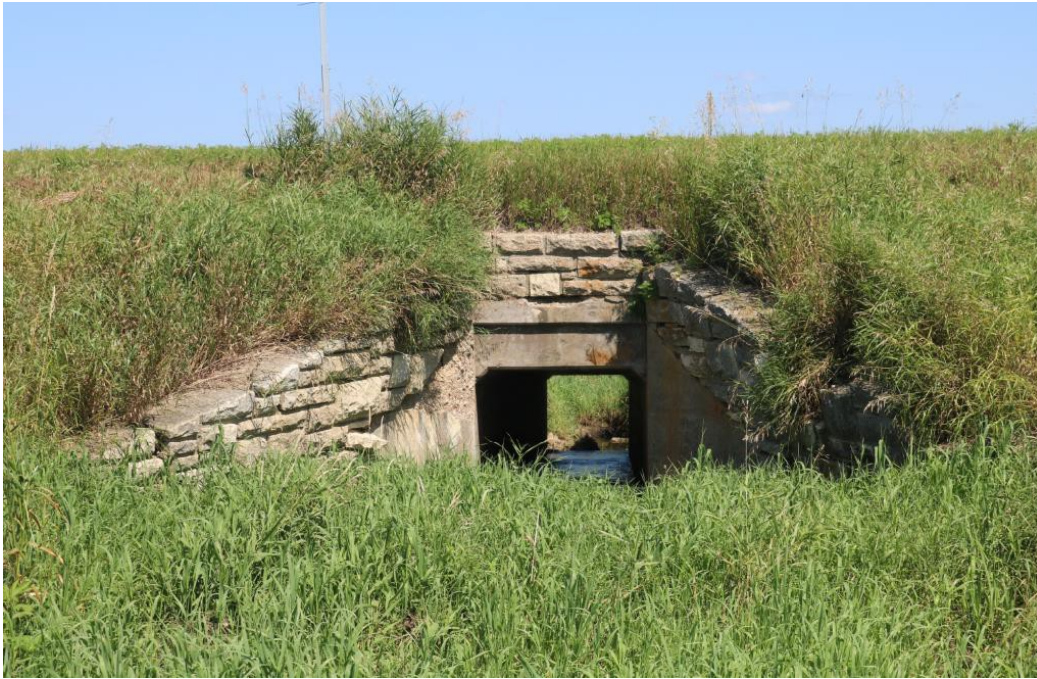
WN-SCT-015, August 1, 2019, east elevation of culvert, view facing west.