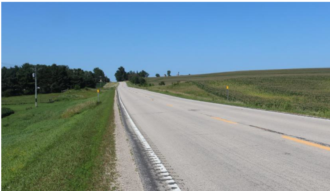
WN-SCT-015, August 1, 2019, view of culvert from TH 74 roadway, facing north.