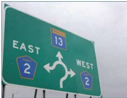
Figure 4: Sign on the approach to the roundabout

The construction of the roundabout took place in 2005 and lasted 90 days. During this time, both State Highway 13 and Scott County Road 2 were closed at the intersection, and motorists were advised to follow the posted detour routes during the closure. Figure 5 shows the construction techniques during construction.