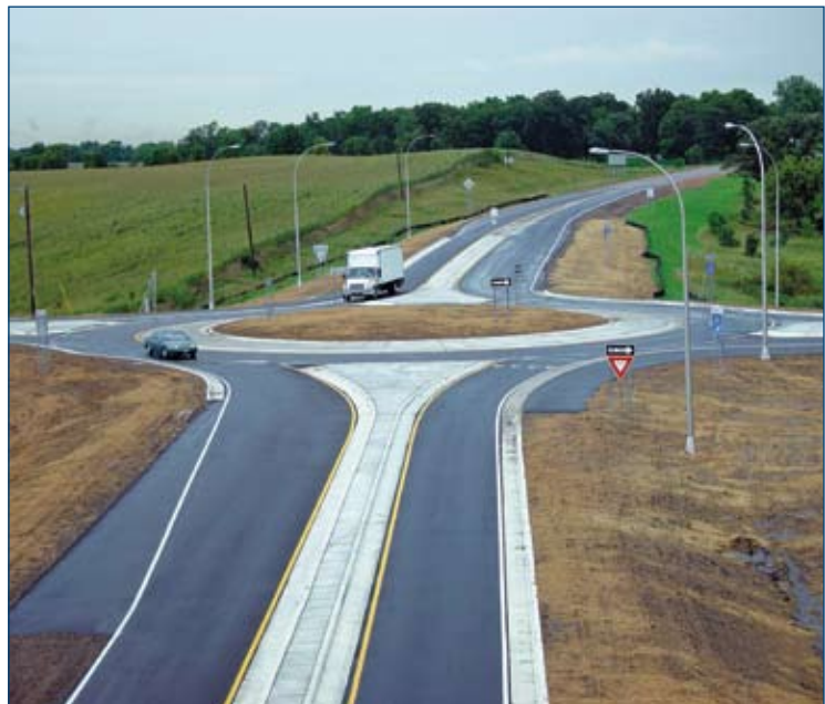
Figure 1: Intersection of State Highway 13 and County Road 2

Paul Kachelmyer Minnesota Department of Transportation