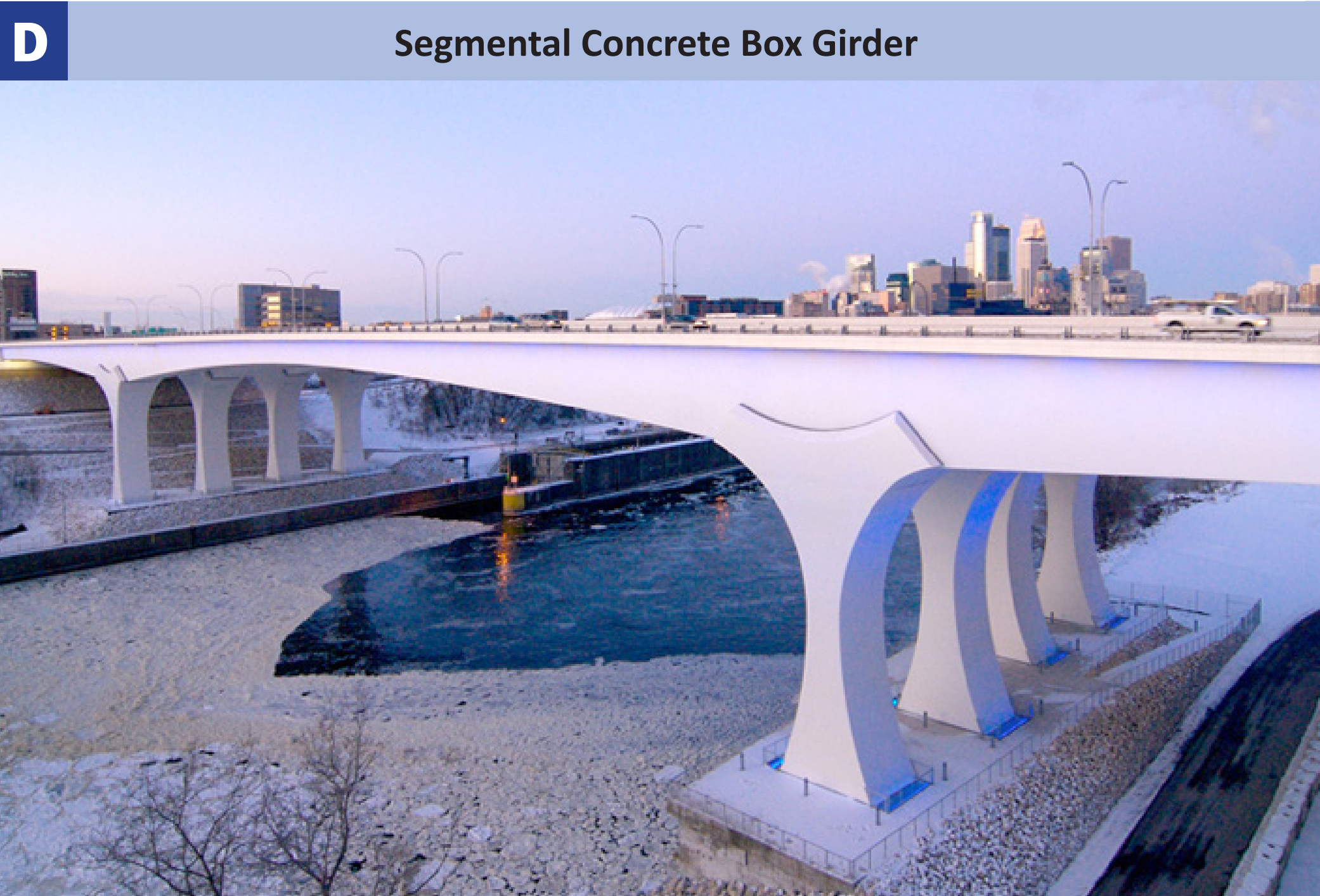
I-35W Saint Anthony Falls Bridge, Minneapolis, MN