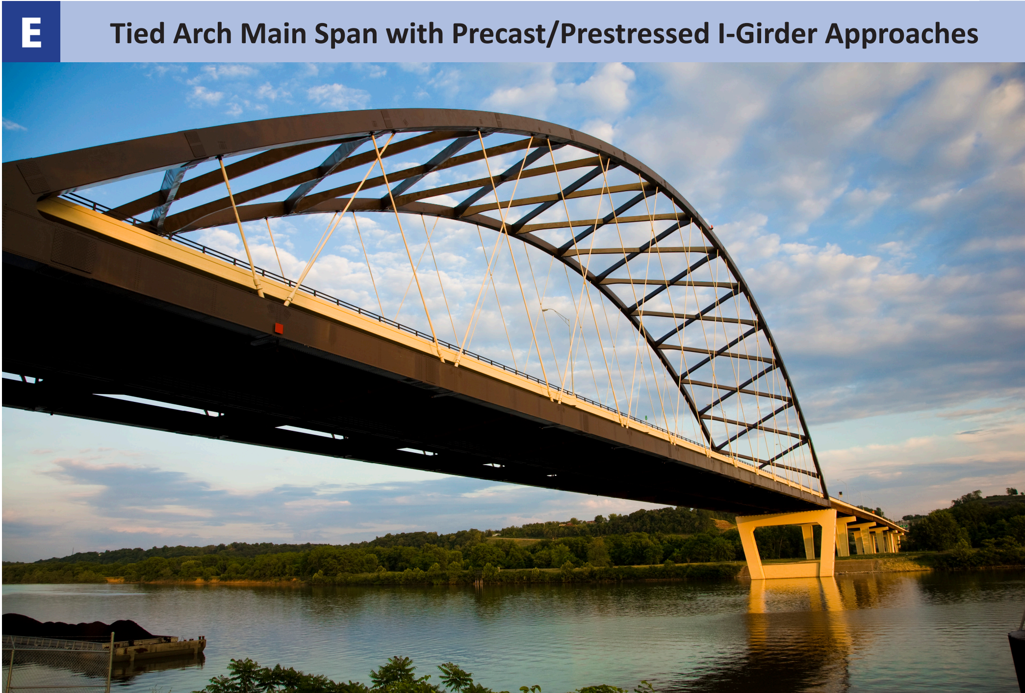
Blennerhassett Bridge, Belpre, OH & Parkersburg, WV