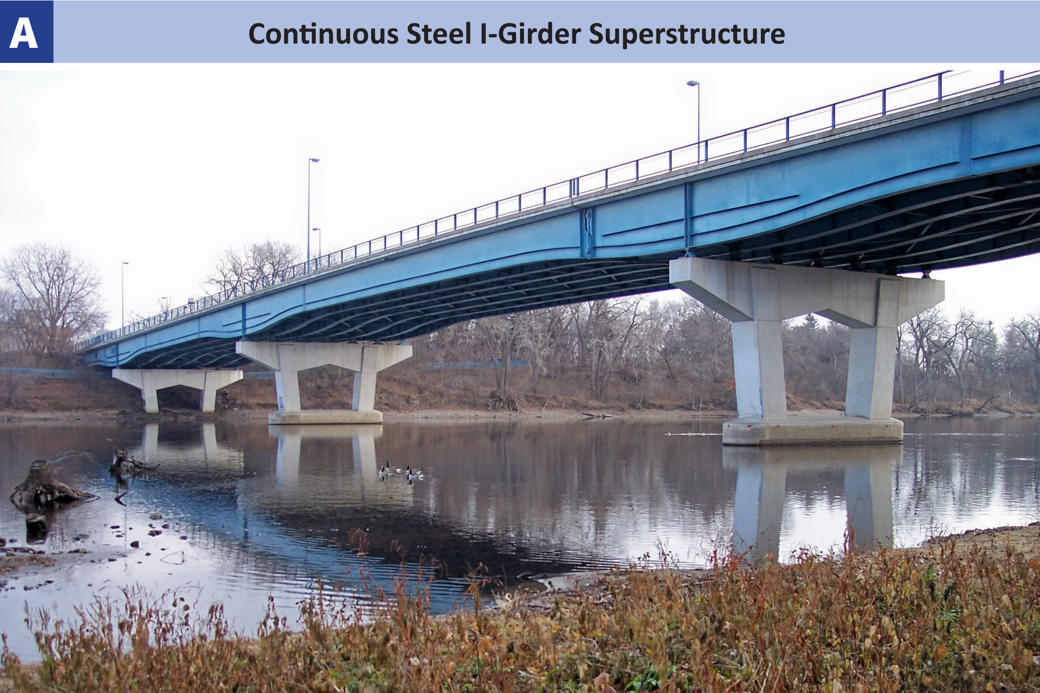
Camden Bridge, Minneapolis, MN