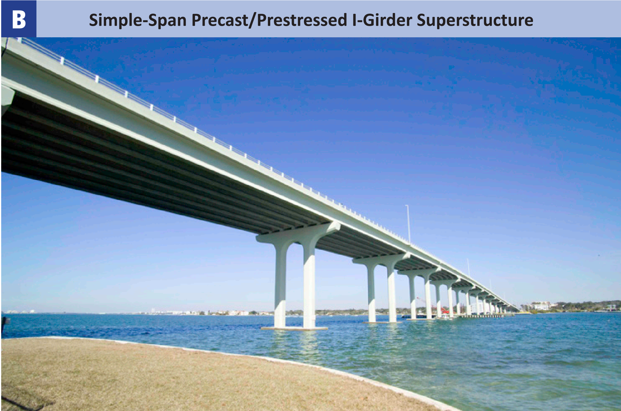
Belleair Beach Causeway Bridge, Belleair Beach, FL