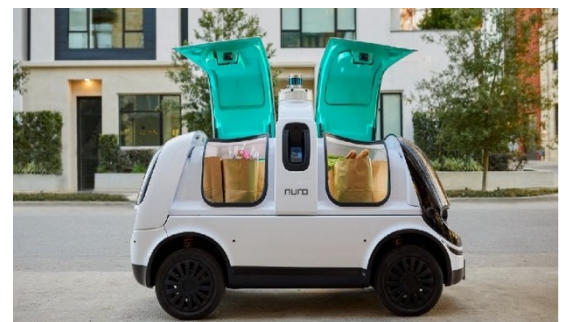
Nuro Delivery Robot