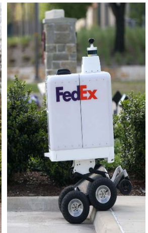
FedEx Delivery Robot