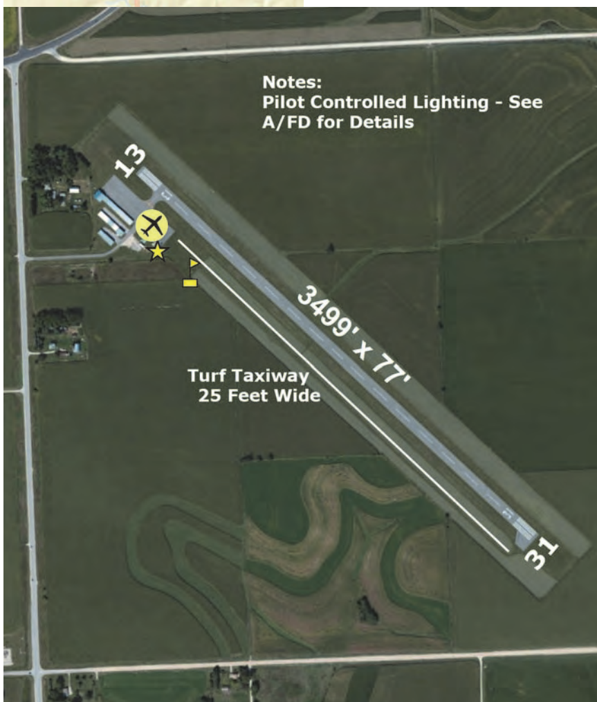
Houston County Airport