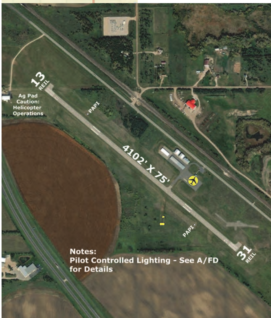
Perham Municipal Airport