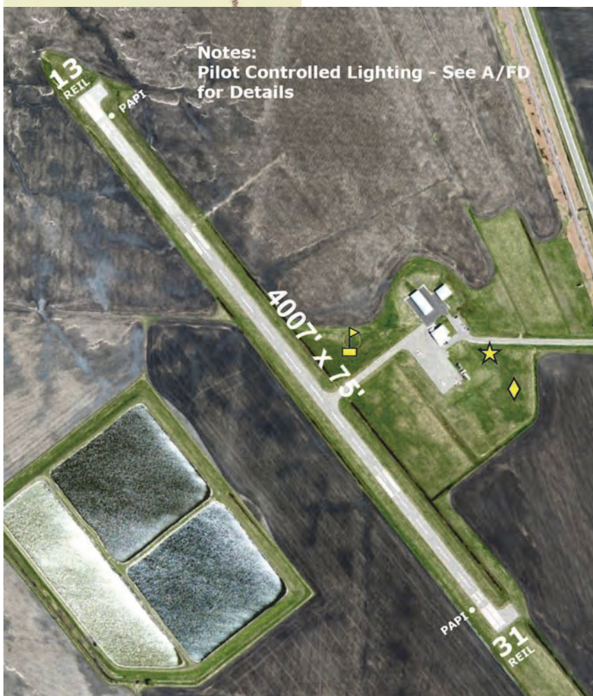
Hallock Municipal Airport