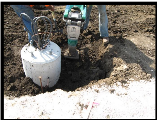
.....Pre-cast concrete light base