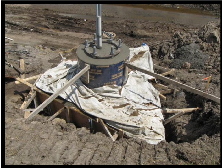
..... High Mast (Tower) light foundation