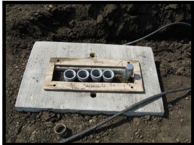
..... Lighting cabinet concrete foundation