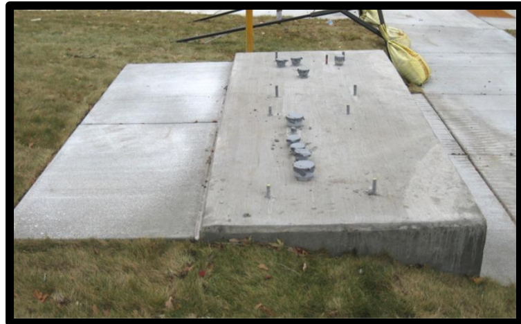
Cabinet/Equipment Pads (Standard Plate 8119). See Appendix for Typical Signal Plan Equipment Pad detail.