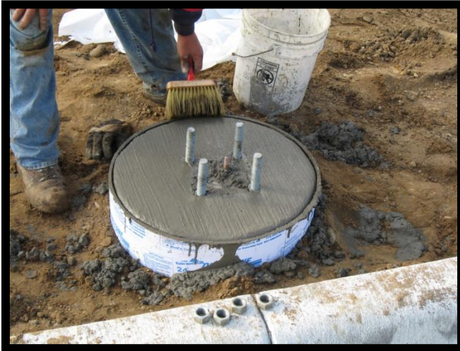
Lighting Unit concrete base .....

There are five basic types of foundations used in roadway lighting construction: