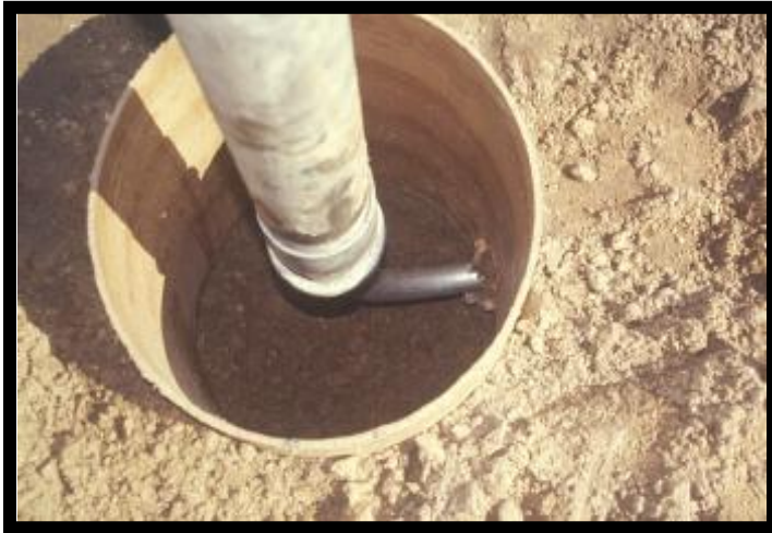
Pedestrian Push Button Stations (Standard Plate 8115).