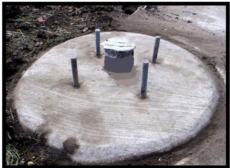
Pedestal Foundation (Std. Plate 8112)

There are four basic types of concrete foundations used in traffic signal construction: