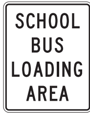
S3-2 600 x 750 mm 24" x 30"