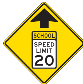
S4-5 900 x 900 mm 36" x 36"