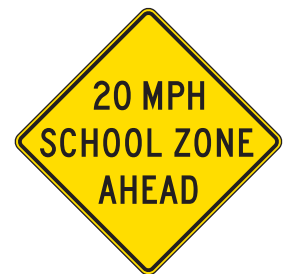
S4-5a 900 x 900 mm 36" x 36"