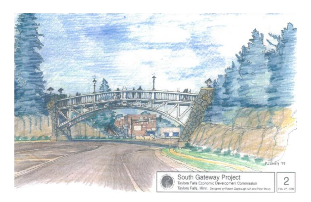
Proposed pedestrian bridge, Taylors Falls

A pedestrian bridge located across highway 8 near the intersection of State Highway 95 was also proposed (pictured below). Additional contacts were made to stakeholders in the northern most portion of the St. Croix Scenic Byway route to obtain additional concerns, issues or project recommendations.