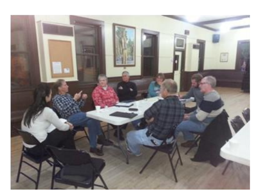
Taskforce meeting, Taylors Falls

centered on the need for improved signage to better mark the St. Croix Scenic Byway route.