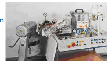
Introducing moisture into a stream of hot asphalt creates a foam that mixes well with aggregates.

Foamed asphalt forms by injecting small quantities of cold, atomized water under pressure into hot asphalt binder. When it makes contact with the binder, water becomes steam and produces asphalt foam that is mixed with pulverized asphalt pavement materials at the job site. As the mix cools and the steam evaporates, the binder-coated aggregate provides a stabilized base source.