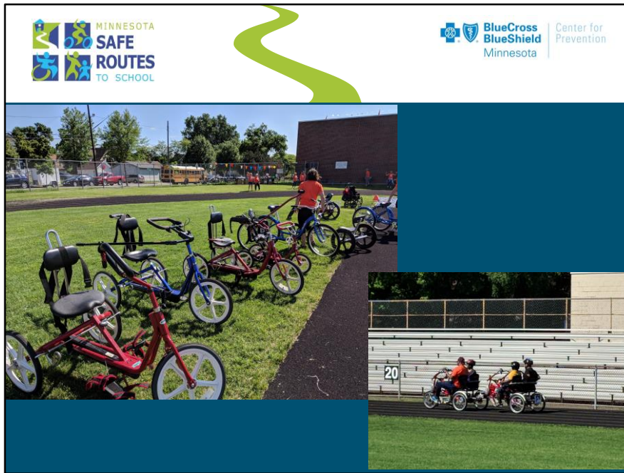
Adapted Bike Day at Minneapolis Public Schools