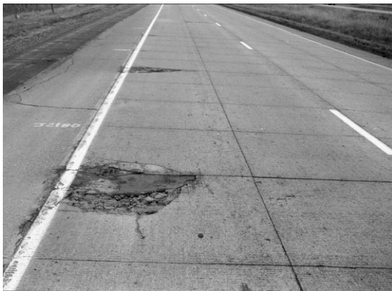
MnROAD UTW 5 x 6-foot section after five million CESALS (November 2003). The driving lane is on the left side.

Pavement failure in an UTW 5x6-foot panel is illustrated below.