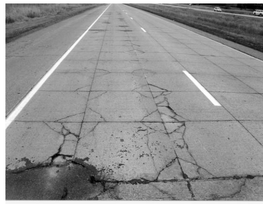
MnROAD 3 inch thick UTW 4 x 4-foot section after five million CESALS. The driving lane is on the left side.

Two UTW test sections consisting of 4x4-foot panels — one 3 inches and one 4 inches thick—both demonstrated corner cracking in locations near the wheelpaths. Heavy loads concentrated near the edge of the thin panels exceeded their load capacity.