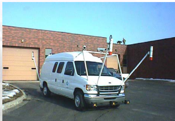
Digital Inspection Vehicle

The DIV is driven on 14,000 miles of the truck highway system every year in both directions.