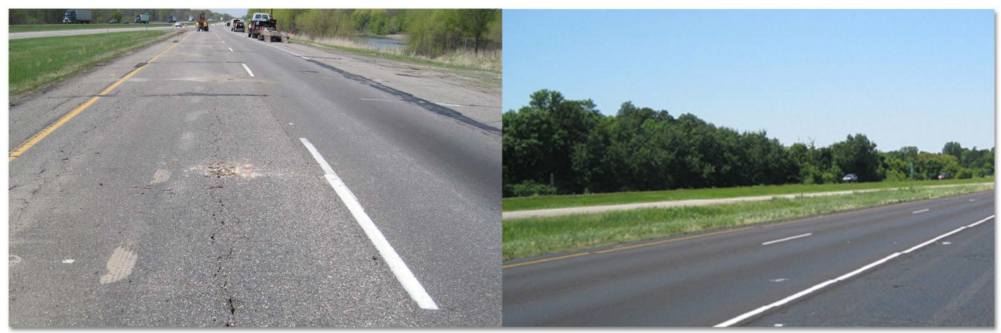
Cell 1 Before Micro Surfacing 2012