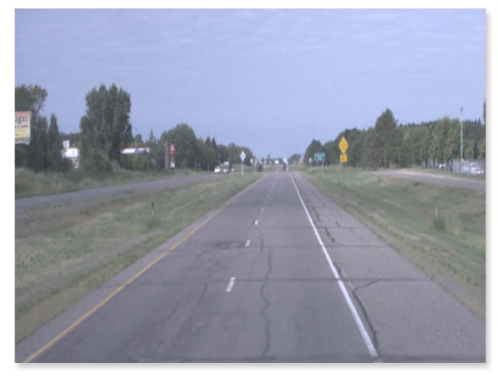
TH23 Before Traditional Micro Surfacing