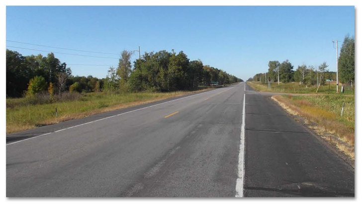
TH 23 Highly Modified Emulsion Right Lane Picture taken 2015. 3 years after placement

District 3 placed a one-mile section on the westbound TH 23 (between MP 227 – 228) using the same highly polymer modified emulsion used in cell 1 at MnROAD. The emulsion application rate for this section was 13% with the same 6.5% SBS polymer loading. District 3 personnel observations are as follows: