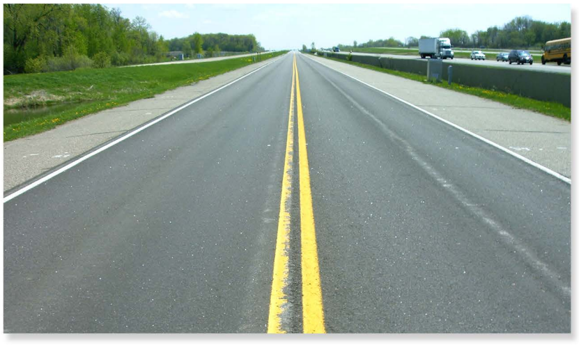
MnROAD Cell 24 - 8 Months After Placement

After one winter, 71% of all transverse cracks reflected through. However, only 5% of the longitudinal cracks reflected through. The increase emulsion and the softer base asphalt proved to be rut resistant. For more information on this project see the report, "Flexible Slurry-Microsurfacing System for Overlay