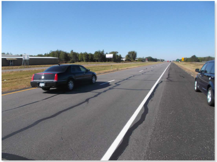
TH23 One Year After Traditional Micro Surfacing