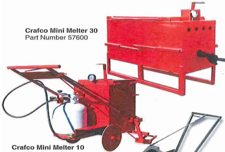
Crafco Mini Melter 30 Part Number 57600

The Mini Melter 30 (air jacketed hand agitated) is a 30 gallon sealant melter and dispenser that can be used in conjunction with the Mini Melter 10 or the Crafco Pour Pot with Wheels.