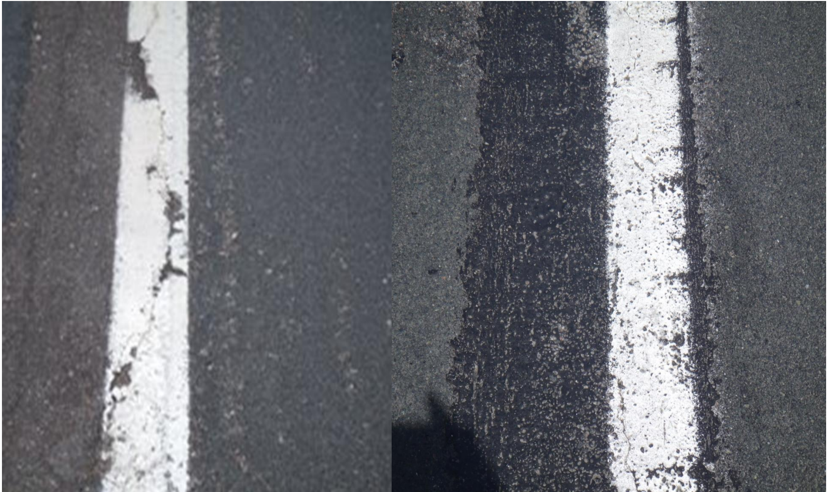
Latex Striping on Aged Pavement