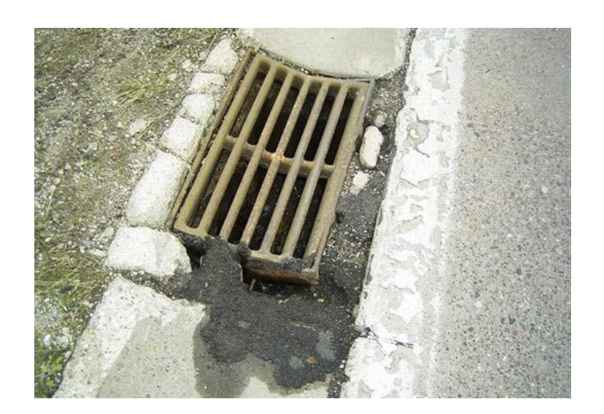
FIGURE 14: CURB DAMAGE AT INLET GRATE

Gutters are typically kept free of all debris so that the water may flow unimpeded to the nearest drainage structure. As a general best management practice, MnDOT maintenance crews sweep to clean gutters in the spring to remove accumulations of winter sand and debris. Grates within curb and gutters, if present, are evaluated to ensure grate openings are of proper size and orientation in the interests of bicycle and pedestrian safety. Damaged or deteriorated areas of curb and gutter (see Figure 14) are scheduled for repair within HYDINFRA when drainage or bicyclist and pedestrian safety has been seriously affected.