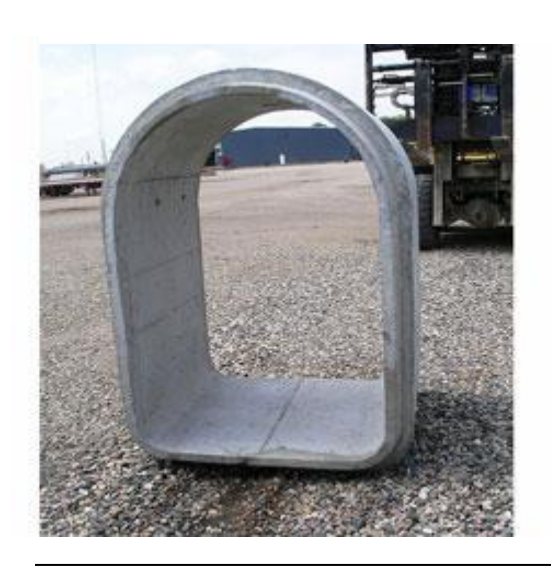
FIGURE 5: CONCRETE CATTLE PASS

Cattle passes should be checked for appropriate culvert marking. It is Department policy to remove only the dirt and debris washed into these structures due to inadequate drainage. All other deposits should be removed by the property owner. Office of Right-of-Way and Survey's files should be checked for special cattle pass agreements with adjacent landowners. A sample cattle pass is shown in Figure 5. New installations are typically made of concrete pipe.