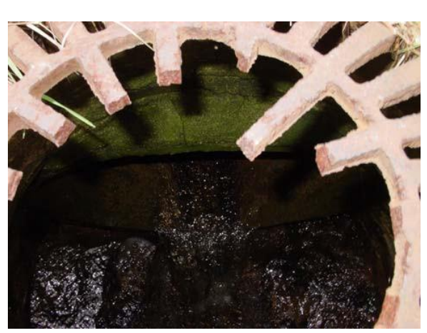
FIGURE 12: SEVERE GRATE DAMAGE

Grates or manhole covers within the HYDINFRA inventory are inspected damage (see Figure 12 for an example of severe grate damage) at the same time they are inspected for cleanout. The covers are considered in satisfactory condition if the seat is clean and free from pebbles or dirt which would cause the cover to move and become a hazard to pedestrians or vehicular traffic. If the grate or cover is broken or damaged, it is flagged for repair or upgrade. Square catch basin grates shall be installed at the proper angle in relation to the flow of water in the gutter.