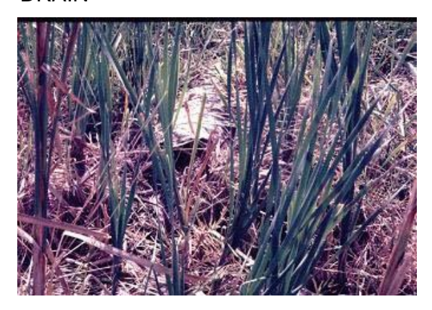
FIGURE 13: CONCEALED EDGE DRAIN

Highway edge drain markers (if provided) should be regularly inspected and replaced or reinserted if found to be deficient. Notes within HYDINFRA should also disclose marking locations and condition of the markings.