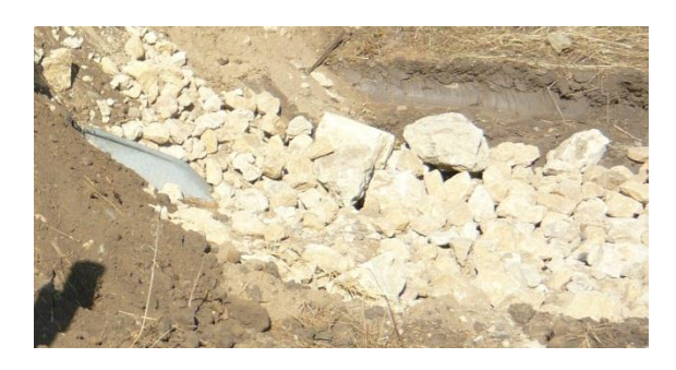
FIGURE 3: RIPRAP DETAILS