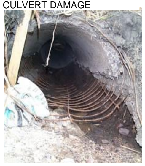
FIGURE 9: TYPICAL SLIP-LINING OPERATION TO REPAIR A CULVERT