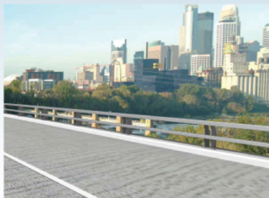
Driver's perspective southbound towards city center