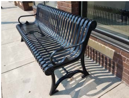
Wrought iron bench