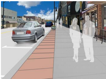
Wider colored concrete band in amenity zone