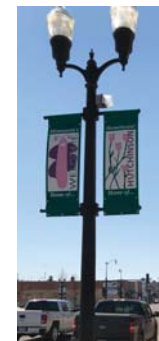
Banners, Pedestrian-scale and intersection lighting