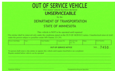
Minnesota Vehicle Out-Of-Service Sticker - Minnesota Department of Transportation