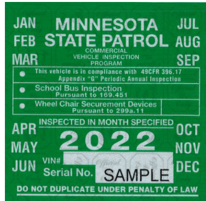
Minnesota Vehicle Inspection Decal

Vehicles passing a MN Annual Vehicle Inspection will be issued a decal valid for 12 months after the month specified on the decal. The owner of the vehicle must keep a copy of the inspection report for 14 months at a location where the vehicle is housed or maintained.