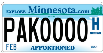
Interstate IRP Plate

Display of Credentials: A valid annual registration cab card, temporary credential, or trip permit must be carried in the vehicle at all times. Minnesota vehicle registrations under the IRP expire at 12:01 a.m. March 2. An IRP registered vehicle may operate with a faxed temporary credential for 30 days without displaying a registration plate.