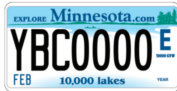
Intrastate Truck Plate