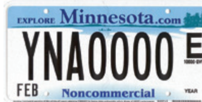
Non CMV Plate

Effective August 1, 2011, legislation established a distinction in registration and license plate display between commercial and non-commercial full size one-ton pickup trucks. Person declaring “personal/non-commercial use only” can register in the “Y” non-commercial truck class for registered weights of 10,000, 12,000 and 15,000 pounds. There is no difference in the registration tax amount; it is merely a plate designed to allow the owner to declare non-commercial use which is exempt from the USDOT number requirement. The plate identifies the vehicle is a non-commercial truck.