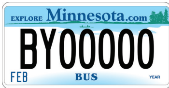
Intrastate Bus Plate

Intrastate Registration Requirements: Vehicles traveling exclusively within Minnesota are required to display Minnesota-based license plates. Intrastate vehicles may be registered and plates obtained at any deputy registrar’s office located throughout the state. Registration fees are determined by the gross vehicle weight and model year of the vehicle. A USDOT number is required. For more information contact Driver and Vehicle Services at 651-297-2126 or visit the website at https://dps.mn.gov/divisions/dvs/ .