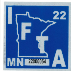
IFTA Vehicle Decal