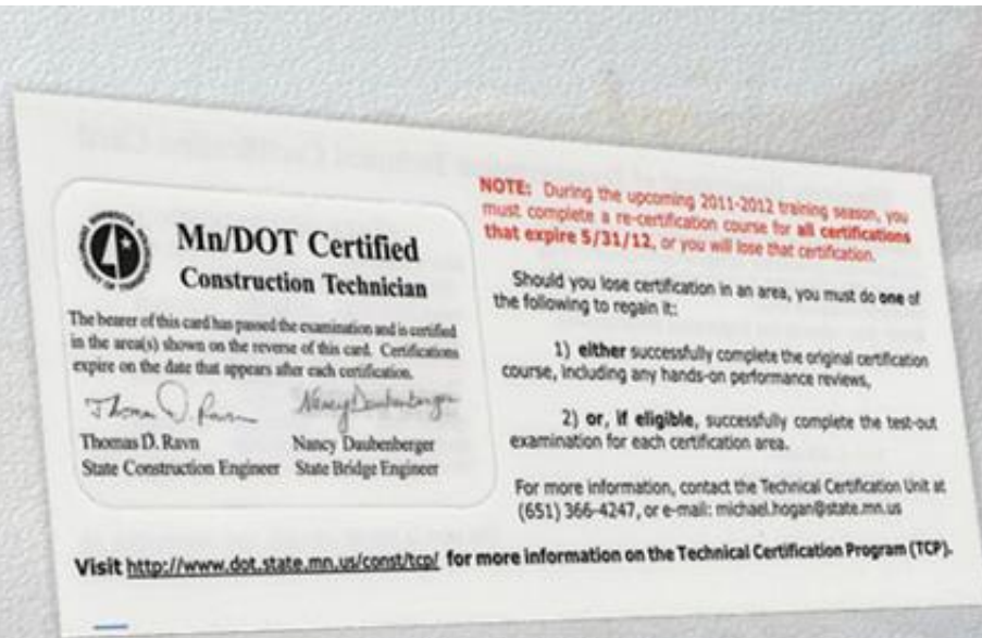
Back of Card