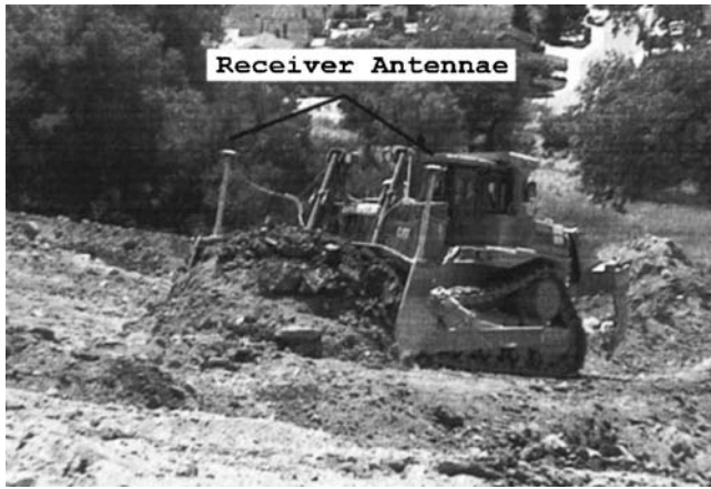
Fig. 4. Caterpillar D9R equipped with SiteVision GPS