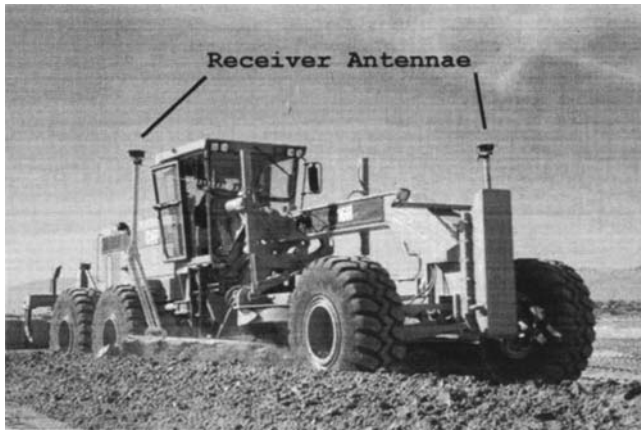
Fig. 2. Caterpillar 16H with SiteVision GPS system

of observation. Similar to the travel and materials cost for surveying, their impact on the cost estimates would be to increase the differences between the guidance methods, as they are usually estimated as a percentage on top of the direct cost.