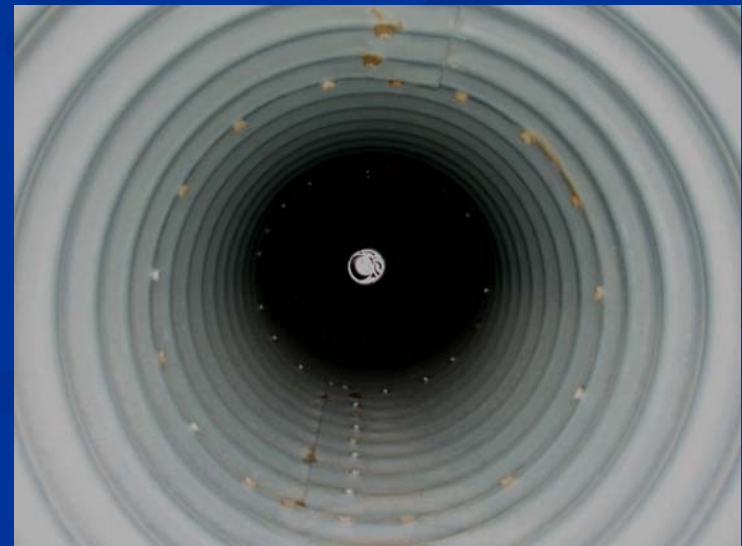
photo 0675 - galvanized annular

photo 0679 - galvanized coating spiral corrugation