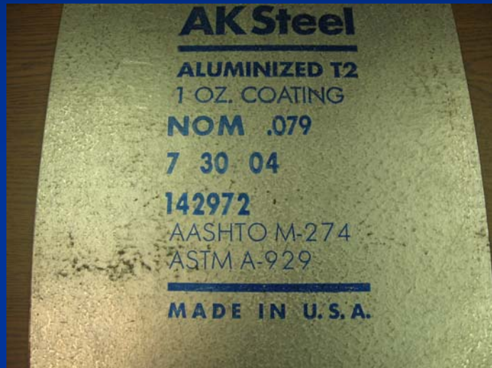
photo 0681- aluminized T2 has same information stenciled on coated steel, date, heat #, manufacturer, ASTM & AASHTO designations.