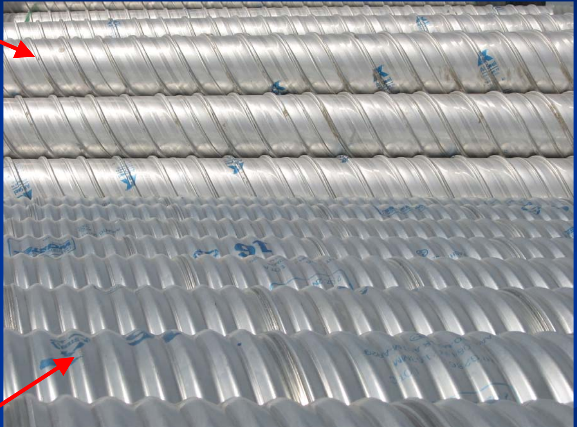
photo 0677 - aluminized Type 2 pipe in spiral rib & galvanized pipe in spiral corrugation (compare different coatings & corrugations)