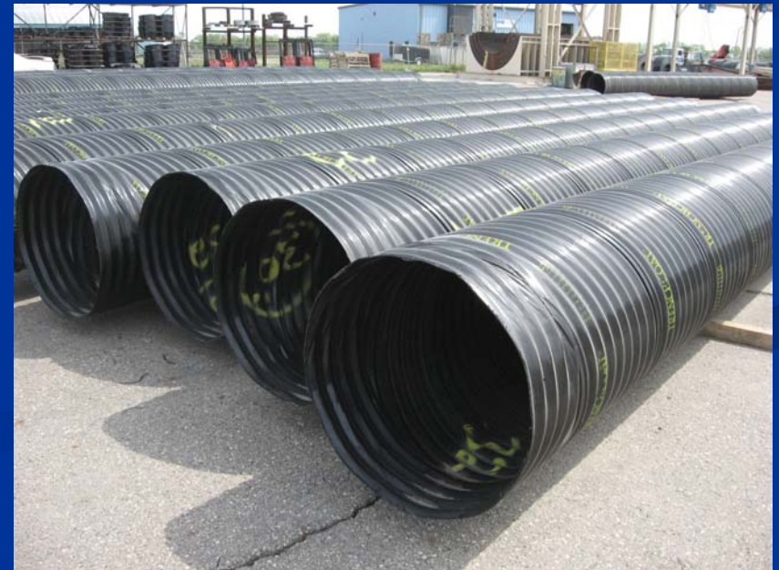
photo 0670- 100 years (plus) service life on the poly coated steel, comes in annular(rivited), spiral & spiral rib - 16ga, 14ga, 12ga.