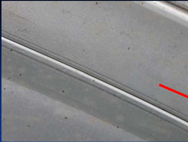
photo 0678 - aluminized type 2- spiral rib corrugation