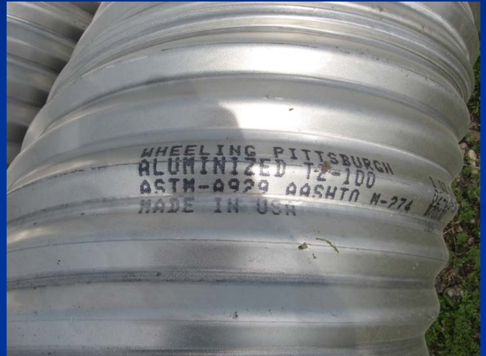
photo 0672 -75 years Manufacturer's projected service life on the aluminized type 2, comes in annular(rivited), spiral & spiral rib - 16ga, 14ga,12ga, & 10ga.

photo 0681- aluminized T2 has same information stenciled on coated steel, date, heat #, manufacturer, ASTM & AASHTO designations.