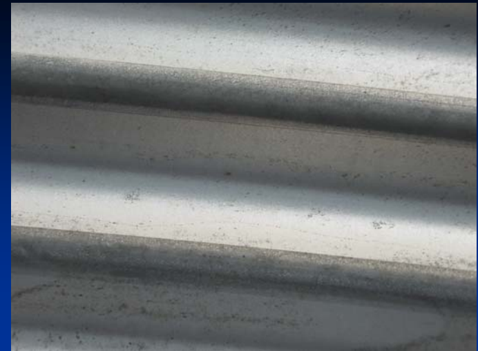
photo 0679 - galvanized coating spiral corrugation

photo 0680- galvanized (Zinc coating) has information stenciled on the coated steel, date, heat #, manufacturer, ASTM & AASHTO designations. (50 years life expectancy)