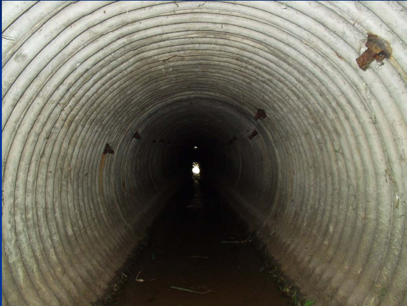
Corrugated Concrete Pipe -- I 35 in Duluth