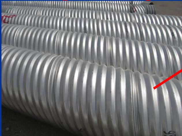
photo 0673 - aluminized Type 2 pipe - in spiral corrugation