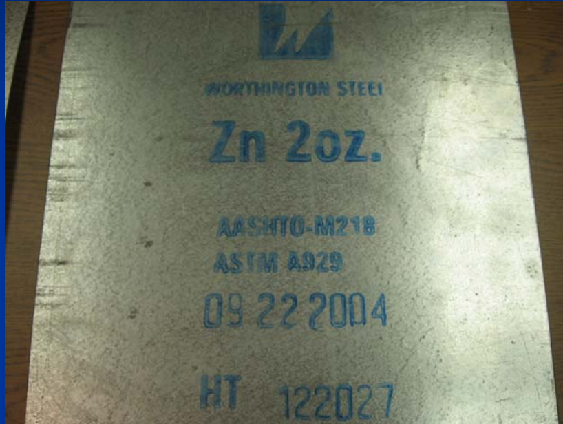
photo 0680- galvanized (Zinc coating) has information stenciled on the coated steel, date, heat #, manufacturer, ASTM & AASHTO designations. (50 years life expectancy)