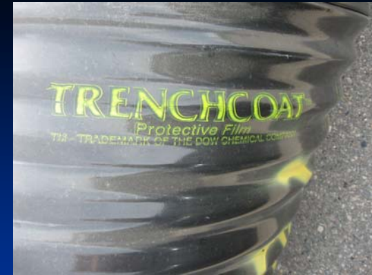
photo 0669- polymeric coated stencil

date, heat #, manufacturer, ASTM & AASHTO designation