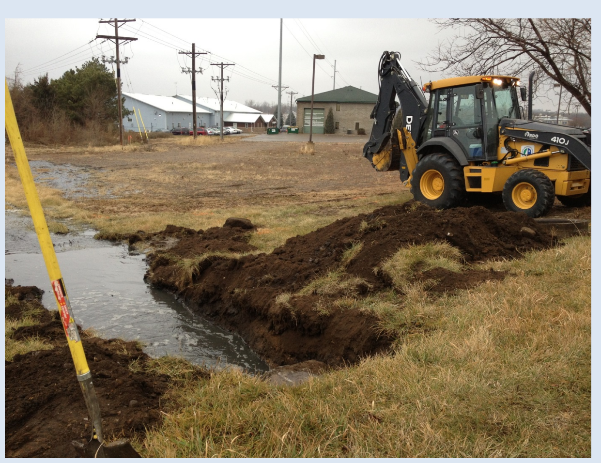
"Cleaning" focuses on the culvert end. Use "Ditch Cleaning" if the largest cost is in the ditch, even if aprons were also cleaned.