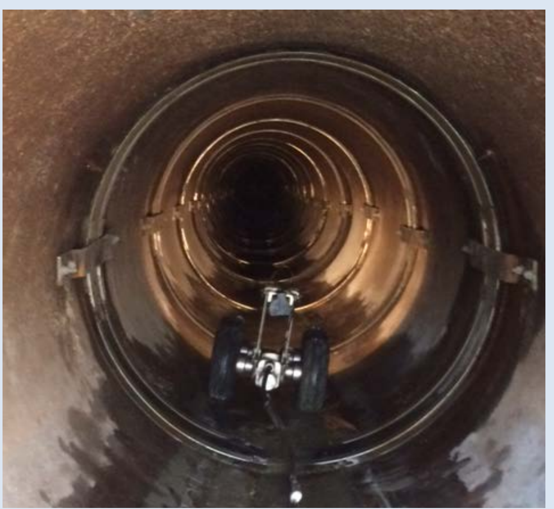
Joint Repair with Internal Bands and heavy-duty pipe ties.

Fix broken or separated joints by installing internal bands or sleeve, filling a gap in the joint, or covering joint from the outside of the pipe -- without moving the pipe itself. May include filling voids in road bed. Repaired Length = 0.