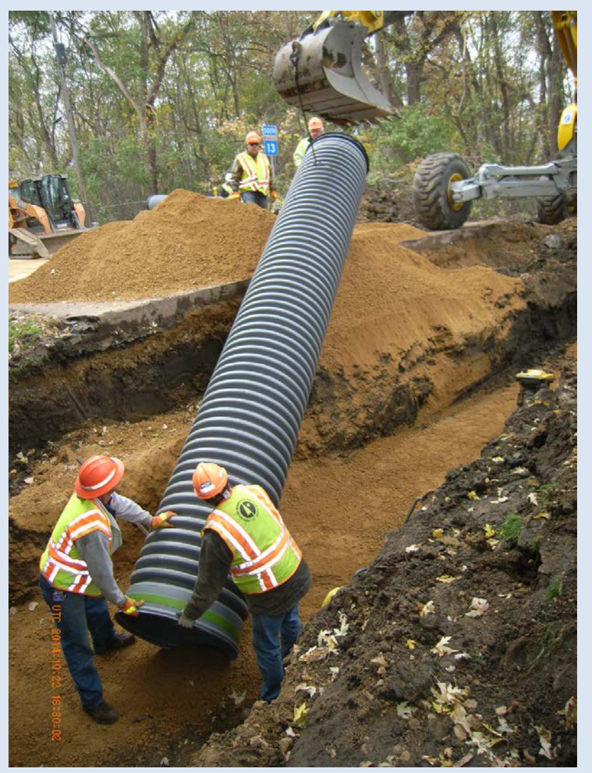
Metro Drainage Crew MN 13 Polypropylene Pipe

Install a new pipe by trenching through the road, then fill and compact the trench. May re-pave the road. Usually includes pipe removal. Repaired Length = length of new pipe.