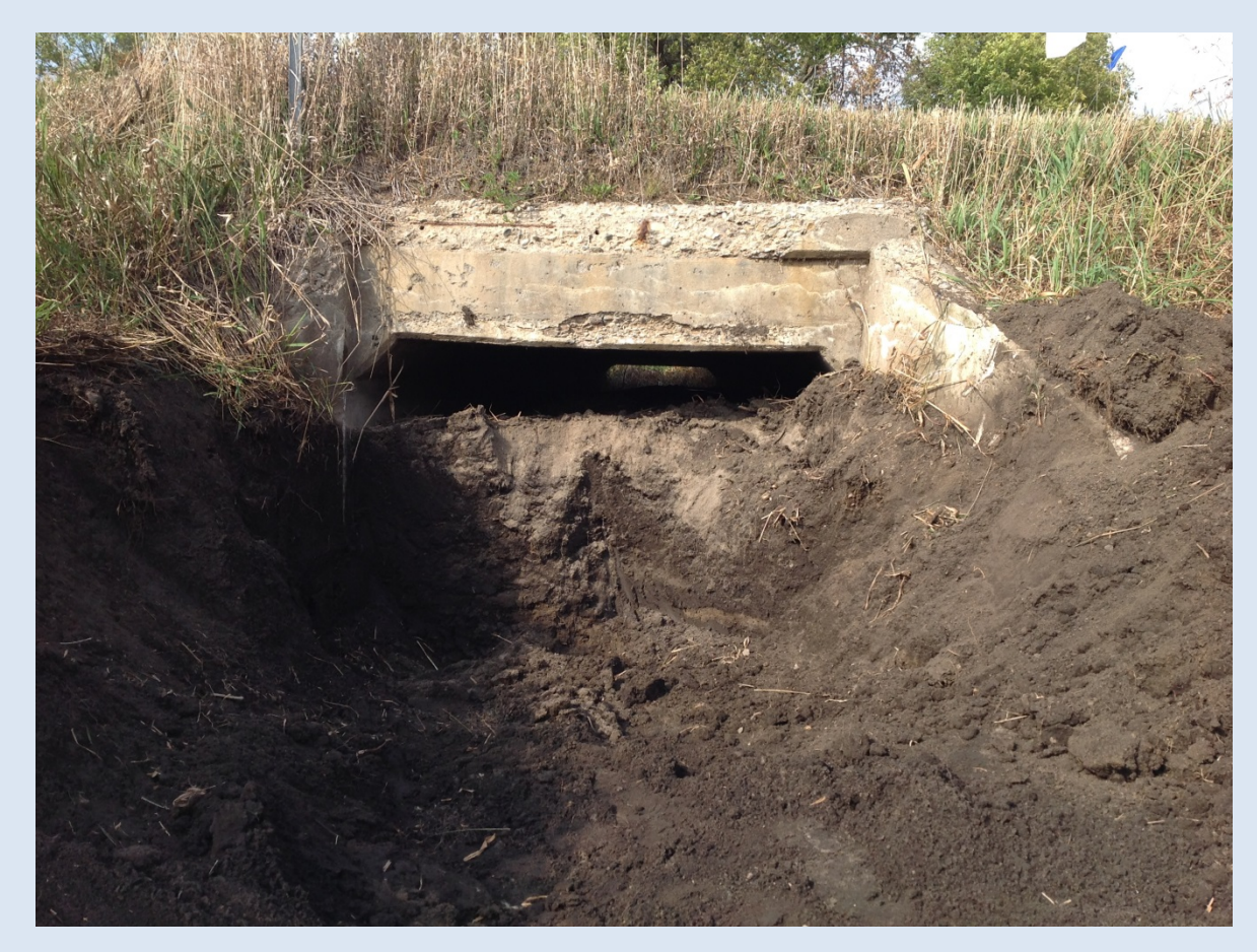
Also use "Clean Done" flag: Major (4+ hours Labor), Minor, None.

Remove dirt or debris from inside a pipe or within 5 feet of an apron. Minor cleaning is 4 hours or less of labor. Major cleaning includes more than 4 hours labor or the use of a jetter or major equipment. Repaired Length = length of pipe cleaned.