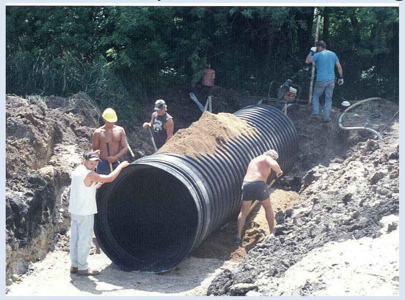
Installation of Kenyon pipe in the '90s S:\Hydraulics\Design_Aids\Pipes and Materials\Case Studies\HDPE Kenyon pictures\ Kenyon PP 2006