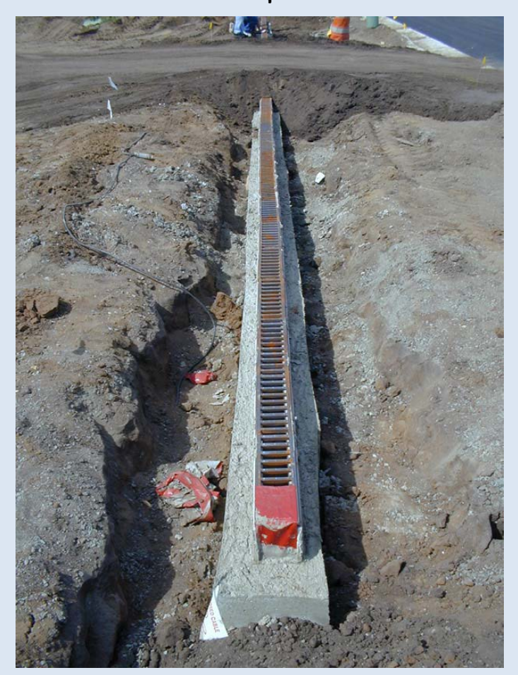
Slotted drain is not culvert but is District's option to record. Photo D2