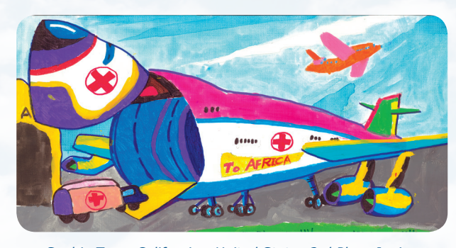
Sophia Tsau, California - United States 3rd Place Junior

Today, helicopters fly rural accident victims to far away hospitals; organs are packed in ice and flown, in the nick of time, to save dying patients; pilots use planes and helicopters to fight large fires; and relief agencies transport food and water to starving and thirsty people around the globe. Flight allows us to see like birds and move faster than the wind, and it has given us the ability to help those who could never be helped before. Can you think of other ways that "flying saves lives?" Let us count or perhaps more accurately, illustrate the ways. Good luck!