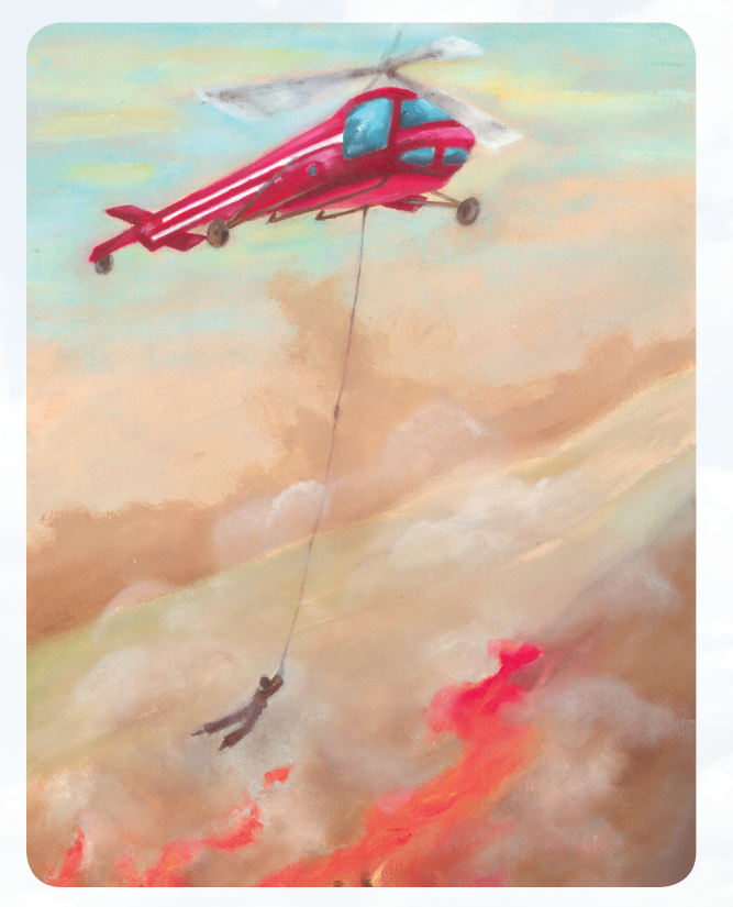
Wendy Chang, California - International 2nd Place Intermediate